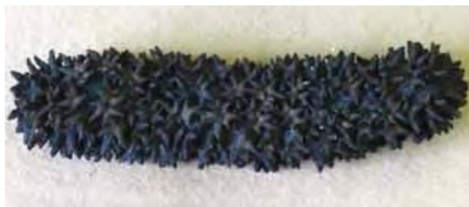
T. ananas (processed)

T. anax is also large, with an average length of 63 cm but a maximum length of 89 cm (Purcell et al., 2012). Its colour varies from creamy white beige to grey or light brown with dark brown and/or reddish spots and blotches dorsally. Those in the Indian Ocean may lack the reddish blotches.