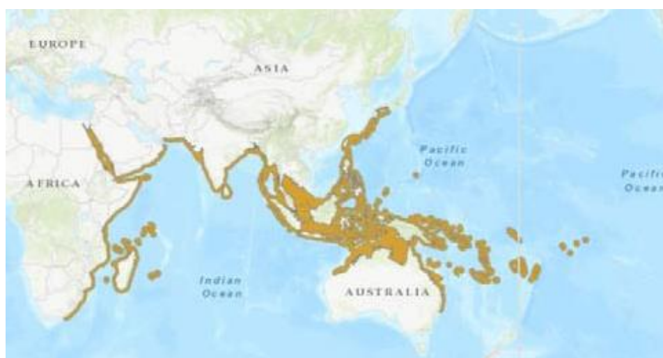
Distribution of T. ananas , IUCN (2012). The IUCN Red List of Threatened Species. Version 2020-2

Thelenota ananas is widely distributed throughout the Indo-Pacific, excluding Hawaii. It occurs in Australia, Bangladesh, Brunei Darussalam, Cambodia, China, Cocos (Keeling) Islands, Comoros, Cook Islands, Djibouti, Egypt, Eritrea, Fiji, French Polynesia, Guam, India, Indonesia, Islamic Republic of Iran, Israel, Japan, Jordan, Kenya, Kiribati, Madagascar, Malaysia, Maldives, Marshall Islands, Mauritius, Mayotte, Mozambique, Myanmar, New Caledonia, Niue, Oman, Pakistan, Palau, Papua New Guinea, Philippines, Réunion, Samoa, Saudi Arabia, Seychelles, Singapore, Solomon Islands, Somalia, South Africa, Sri Lanka, Sudan, Taiwan Province of China, United Republic of Tanzania, Thailand, Tonga, Tuvalu, United States of America (Northern Marianas Islands), Vanuatu, Viet Nam and Yemen (Conand et al., 2013a; Kinch et al., 2008).