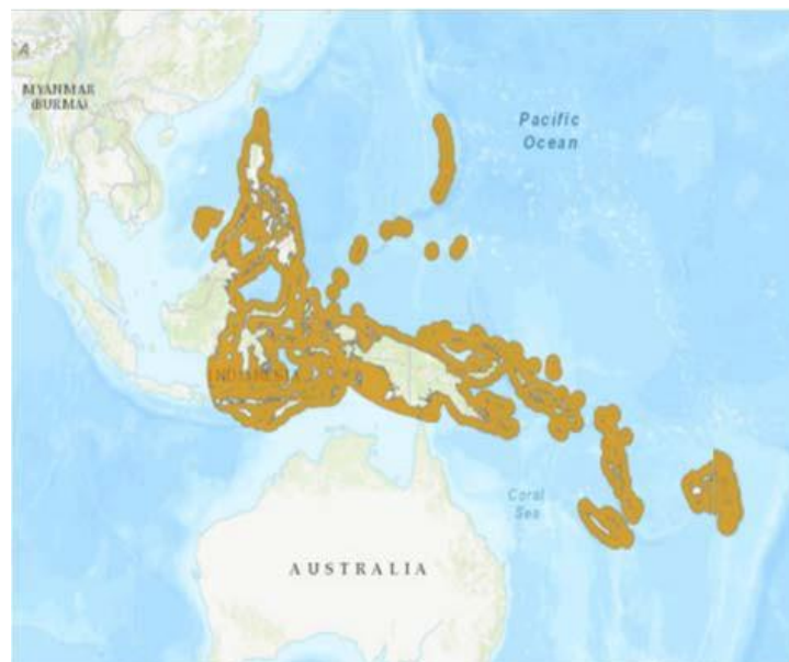
Distribution of T. rubralineata , IUCN, 2013. The IUCN Red List of Threatened Species. Version 2020-2

Thelenota rubralineata is found only in the east Pacific; it has not been identified in the Indian Ocean (Kinch., 2005; Lane, 2008), unlike the other two Thelenota species. T. rubralineata 's range includes Australia, China, Cook Islands, Fiji, Guam, Indonesia, Malaysia, Federated States of Micronesia, New Caledonia, Palau, Papua New Guinea, Philippines, Solomon Islands, Taiwan Province of China, Timor-Leste, United States of America (Northern Mariana Islands) and Vanuatu (Conand et al., 2013b).