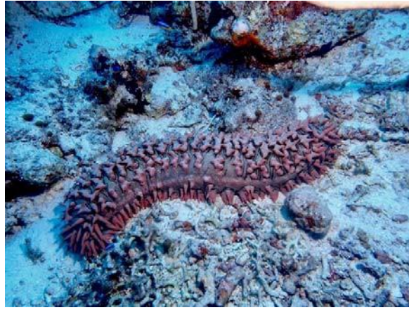
T. ananas (live)