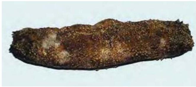
T. anax (processed)

T. rubralineata is also a relatively large sea cucumber, with an average length of 30-50 cm (Purcell et al., 2012). The species' appearance is striking: it is whitish with a complex pattern of crimson lines in a maze-like arrangement. Dorsally, the species has two rows of 13-15 large, conical, fleshy protuberances with pointed papillae at the ends, with yellowish brown tips. The body is roughly square or trapezoid in transverse section, and the posterior part of the body tapers slightly. The ventral surface is flattened and has numerous greenish-yellow or brownish-yellow podia scattered randomly. The mouth is ventral with 20 dull-red tentacles. For ossicles, the species has tentacles with only rods, which can be spiny or smooth, straight or curved, 10-150 \mu\text{m} long (Purcell et al., 2012).