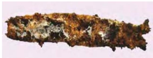
Live T. rubralineata (left) Processed T. rubralineata (right)