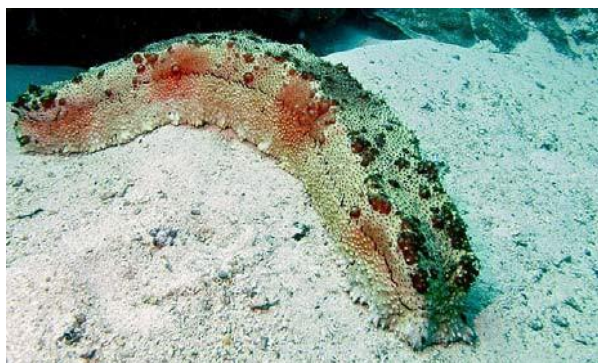
T. anax (live)

In its dried form, T. anax is 15-20 cm long, relatively elongate with a squarish cross-section, and brown in color. The dorsal surface is rough and covered with wart-like bumps. The ventral surface is grainy (Purcell et al., 2012).